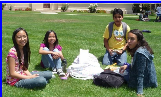
Field Trip to Santa Clara - SV